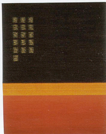
untitled 86, 2001, Rebecca Bluestone. Hand-dyed silk, metallic thread, cotton. Lent by the artist.

Using a palette of nuanced tones and textures, Santa Fe artist Rebecca Bluestone explores and exploits the effects of light. Like the Southwest landscape that inspires her, Bluestone's tapestries are full of shifting colors, luminous and shadowy by turns.